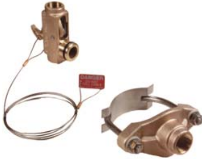
BA and BA-NL Series